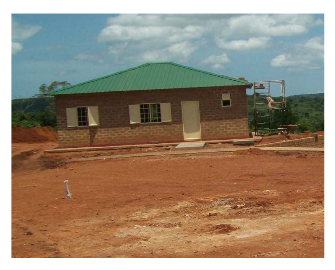
Above: House 45 and below, part of the Circle 4 walk ways and stair cases.